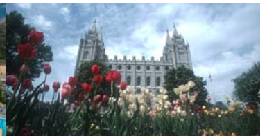
Temple Square in Salt Lake City