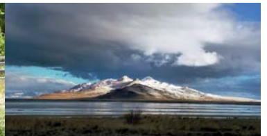
Antelope Island State Park