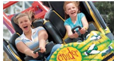
Lagoon amusement park, Farmington