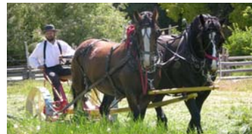
Horse-drawn farming exhibit at the American West Heritage Center, Cache Valley