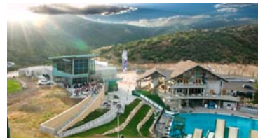
Ski Jumping facilities at Utah Olympic Park, Park City

With over 800 scheduled daily flights from Salt Lake City International Airport, Utah is the perfect gateway to the Intermountain West's premiere attractions!