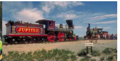
Golden Spike National Historic Site, near Brigham City