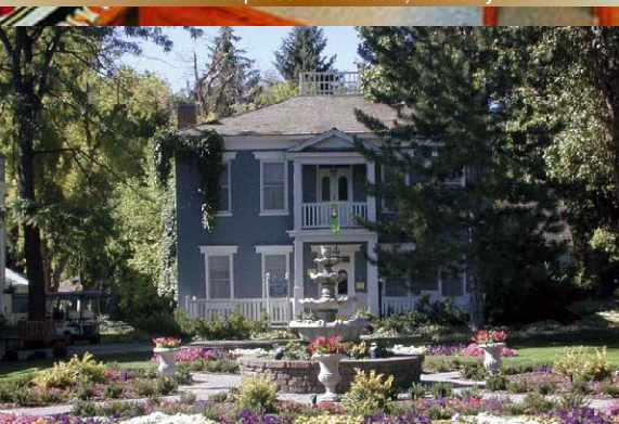
The spa at Homestead Resort, Midway, Heber Valley