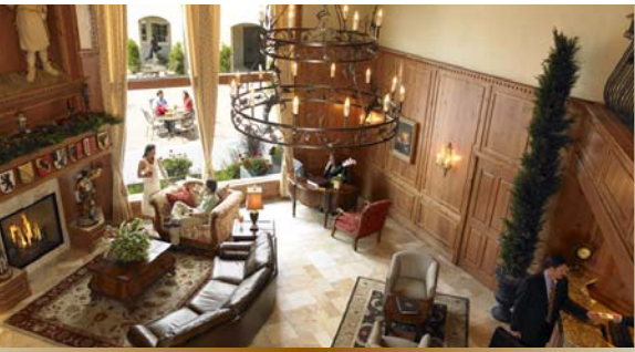
Zermatt Resort, Midway, Heber Valley