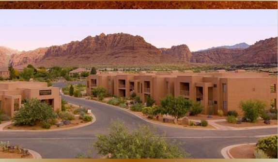
Red Mountain Resort &amp; Adventure Spa, St. George