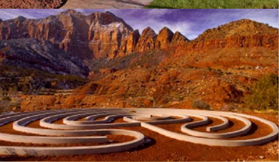
The Labyrinth, Flanigan's Deep Canyon Adventure Spa, Springdale