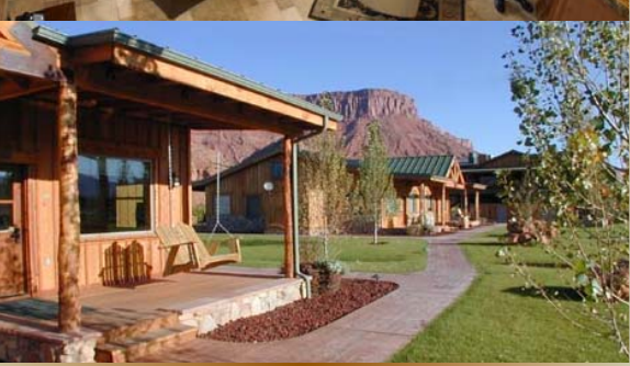
Guest cabins at Sorrel River Ranch, Moab