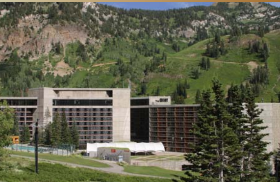
The Cliff Lodge at Snowbird