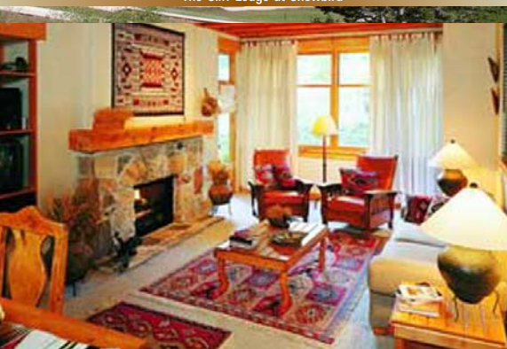
A suite at The Spa at Sundance Resort, Provo Canyon